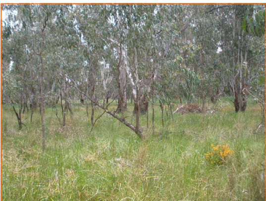
Photo Above: Site 2 Fitzjohn Street, Floodplain riparian woodland/ Sedgy riverine forest mosaic. Photo right: Site 1 Kialla Landfill, Riparian Woodland.

These land assessments assist Council and other agencies to better manage these lands and plan for future developments.