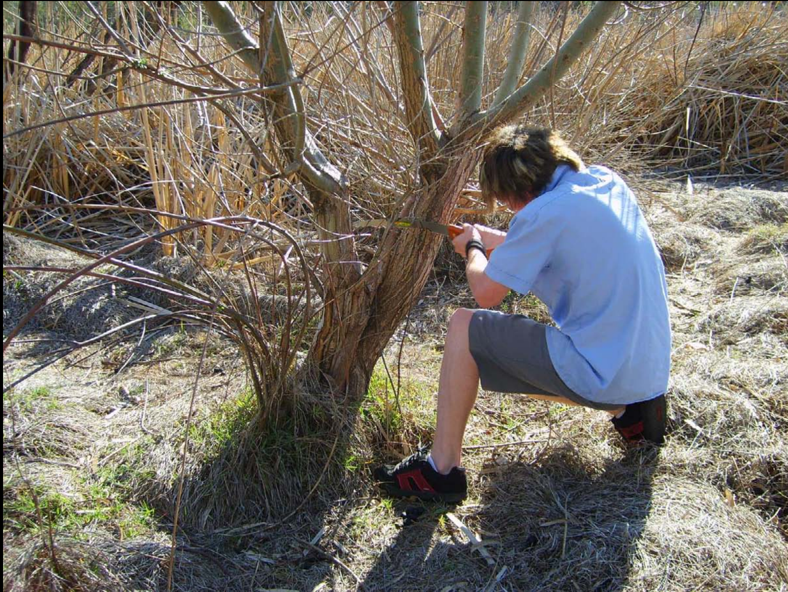
Stem injection of willows by VCAL students at Reedy Swamp