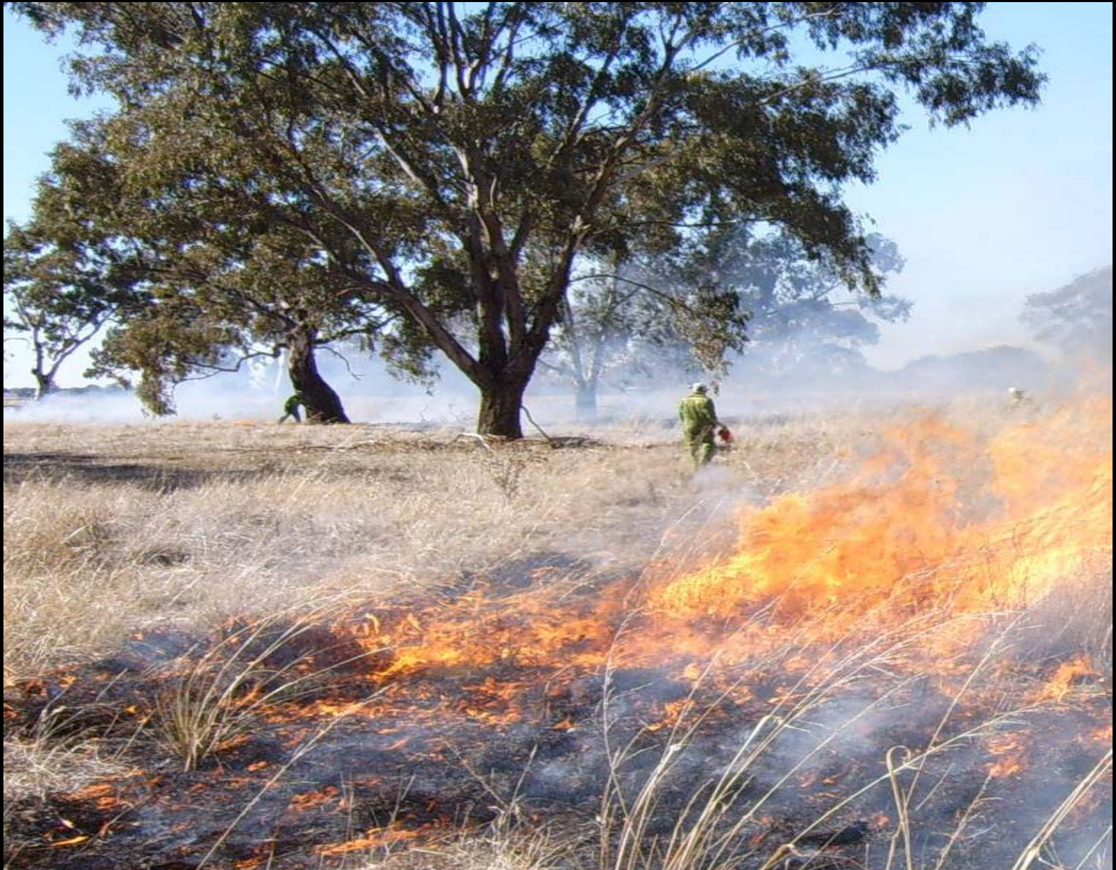
Fuel reduction burning in red gum woodland