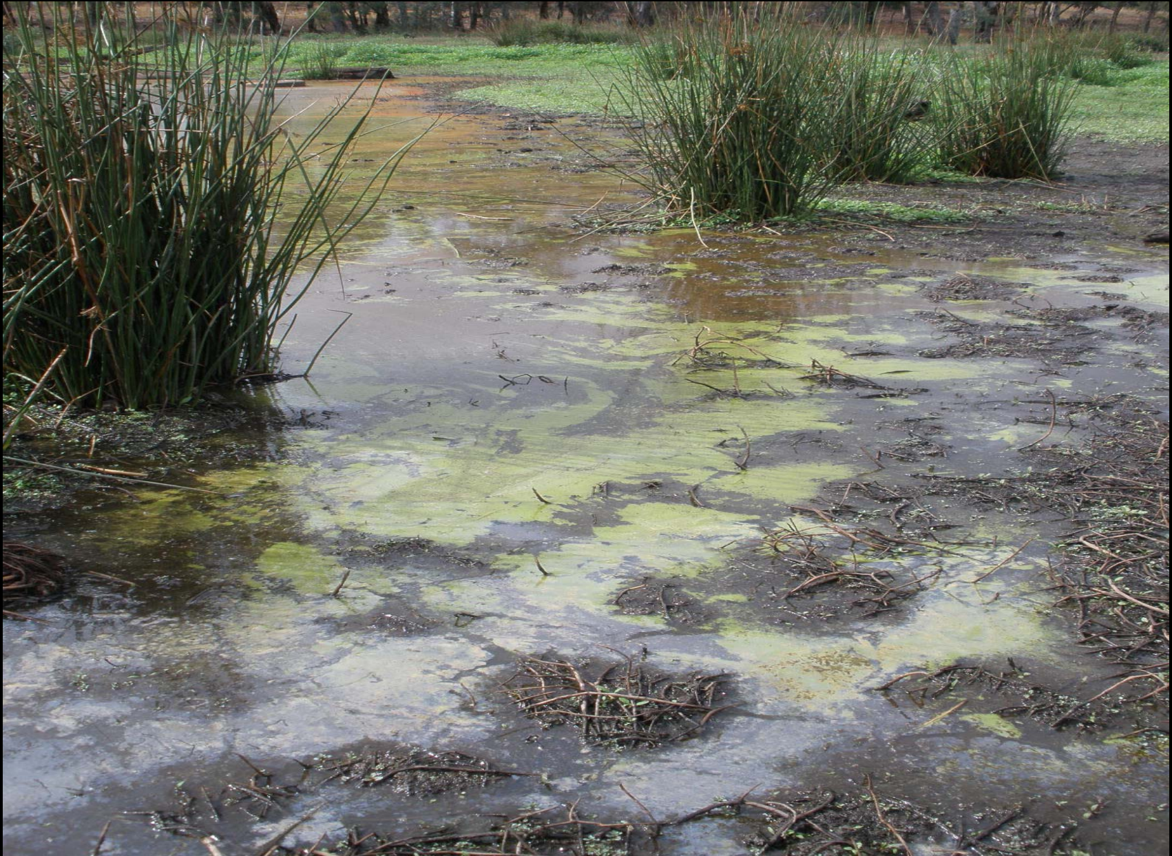
Blue green algal bloom, Reedy Swamp, March 2009