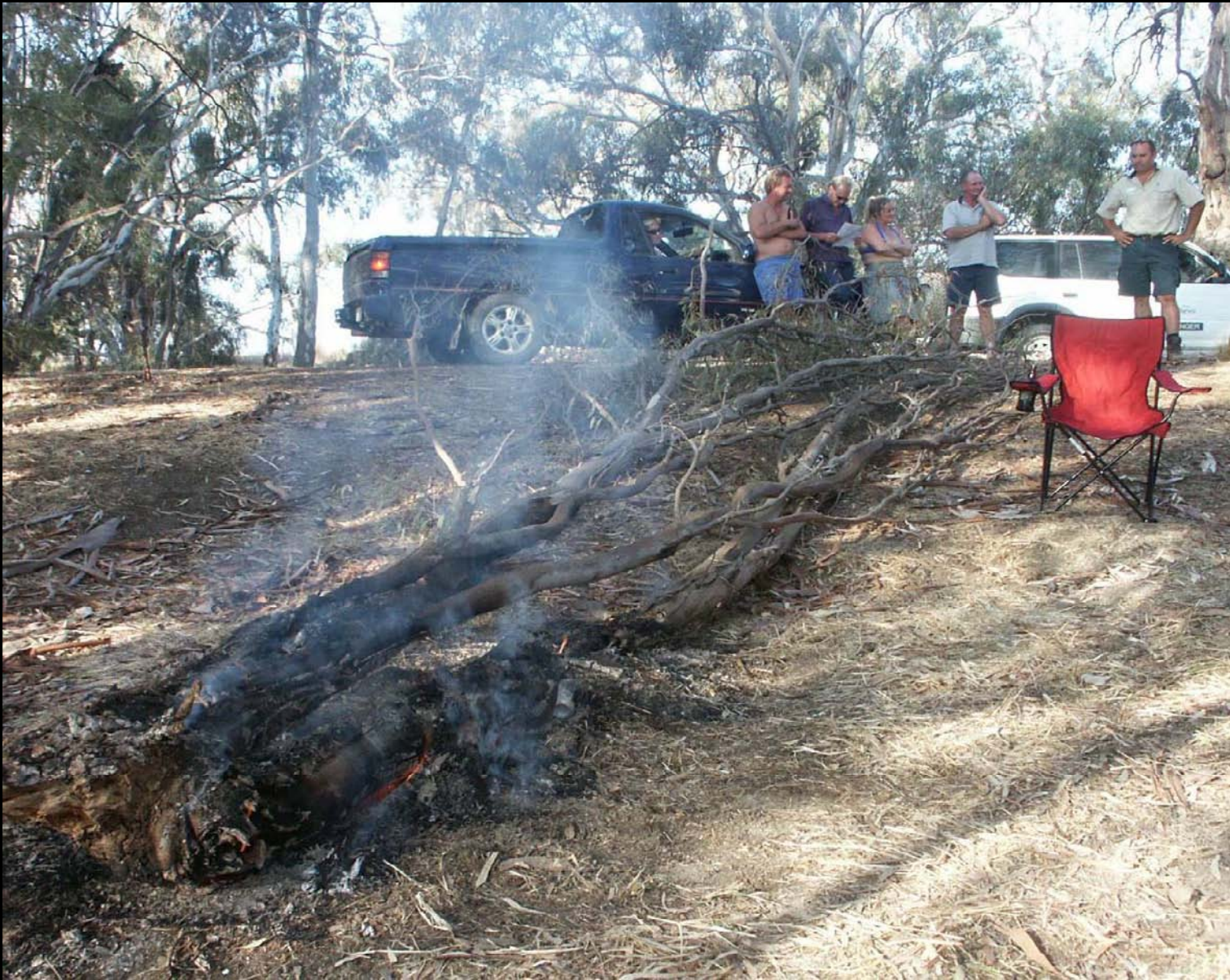
Enforcing campfire regulations