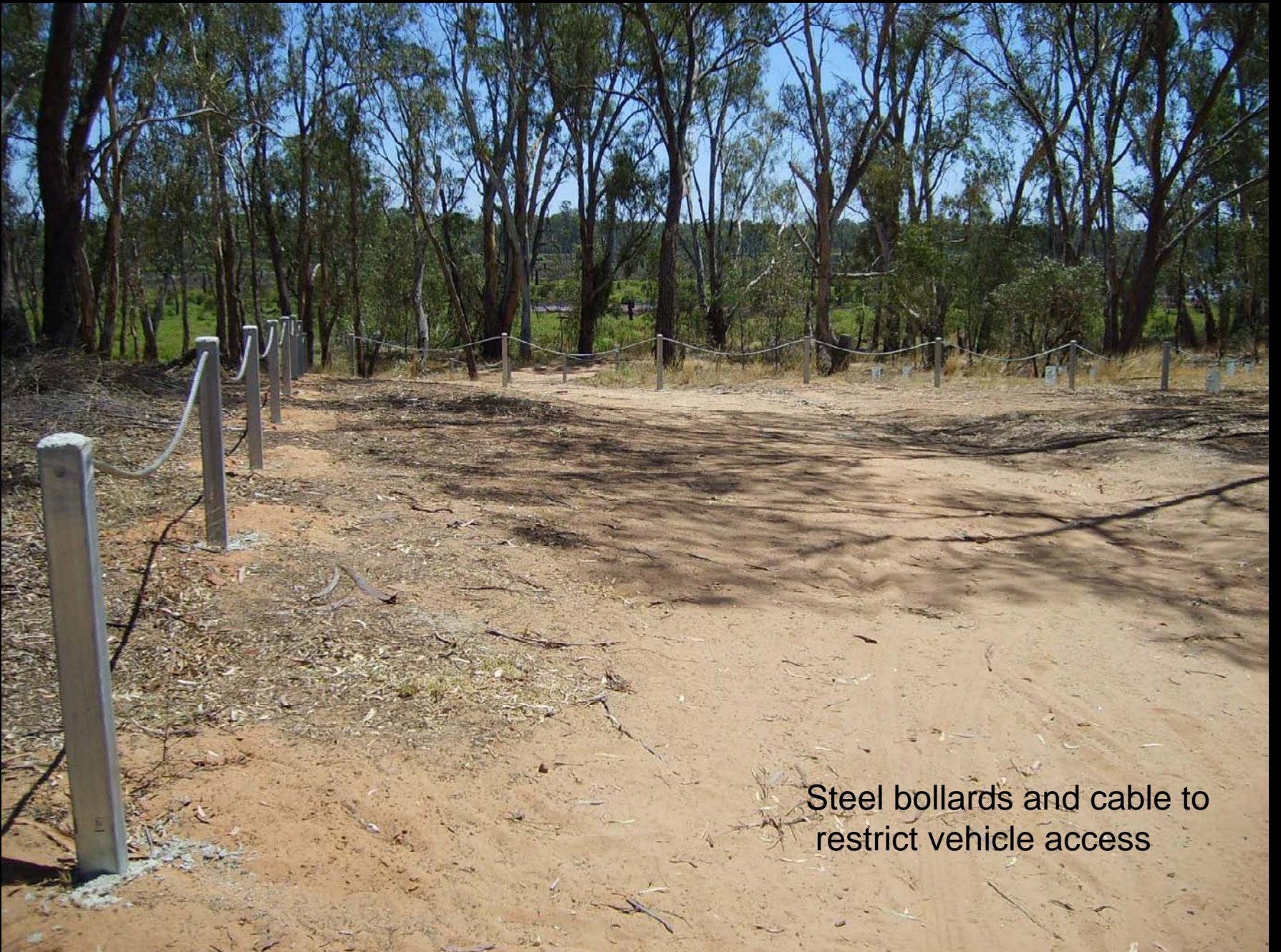
Steel bollards and cable to restrict vehicle access