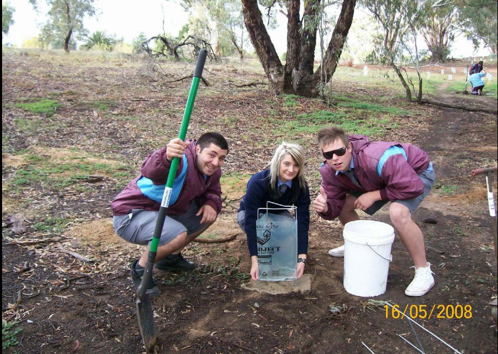
Revegetation by VCAL students at Reedy Swamp