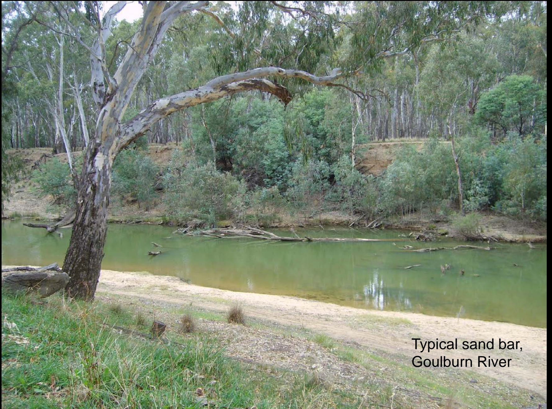
Typical sand bar, Goulburn River