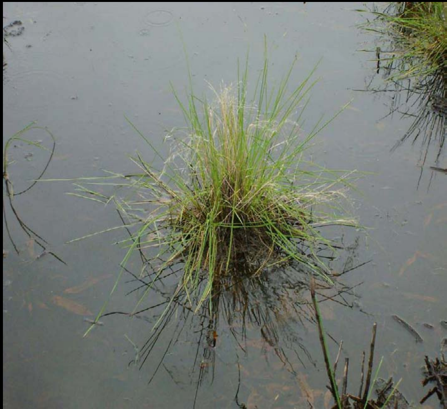
River Swamp Wallaby Grass stimulated by watering