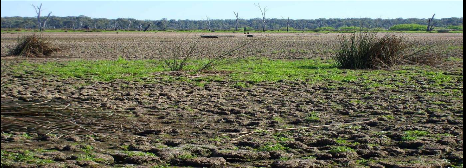
Reedy Swamp before and after environmental water delivery