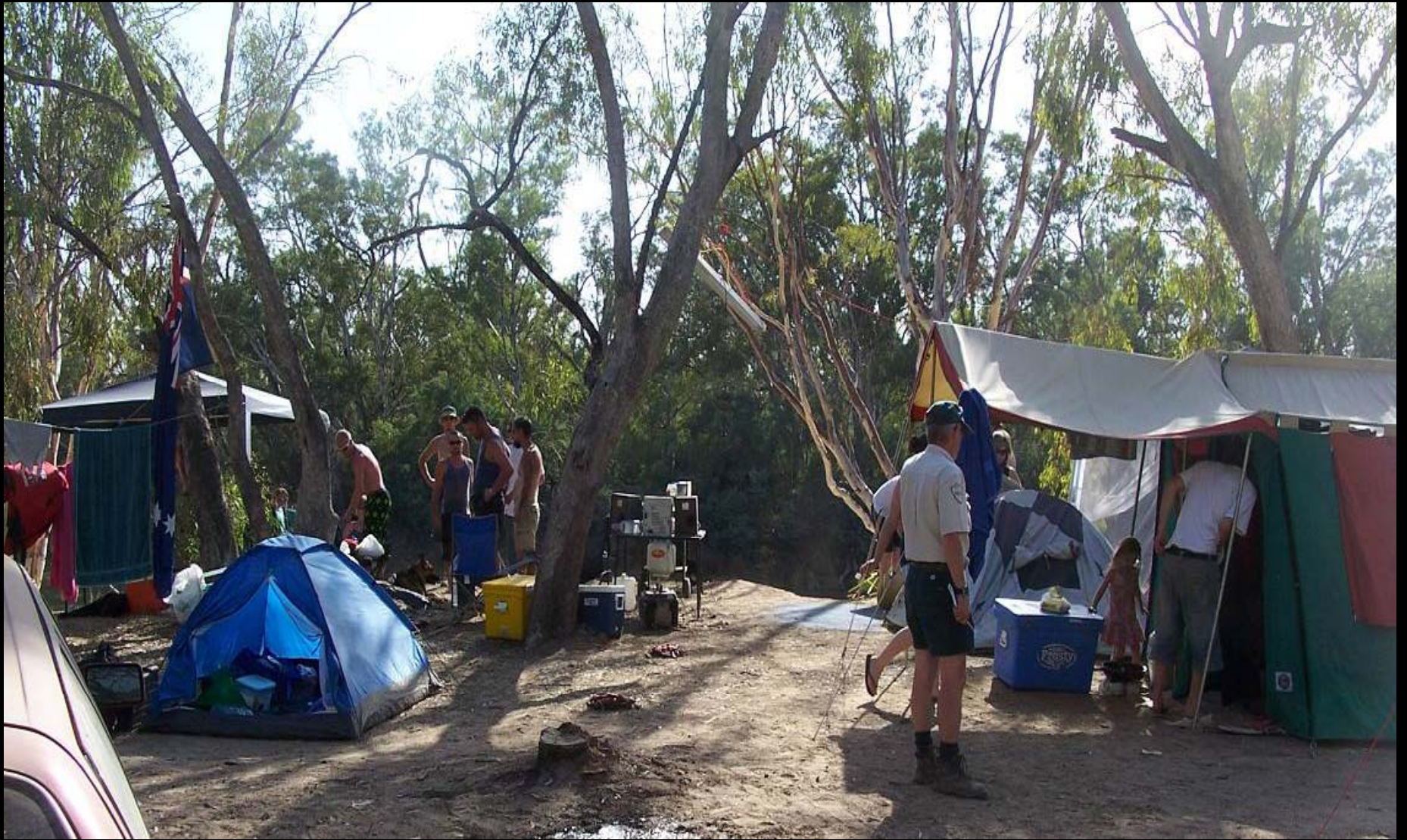
Enforcing camper regulations