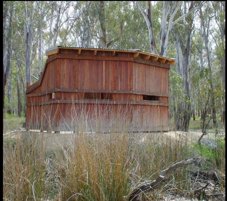
Bird hide, Gemmill Swamp