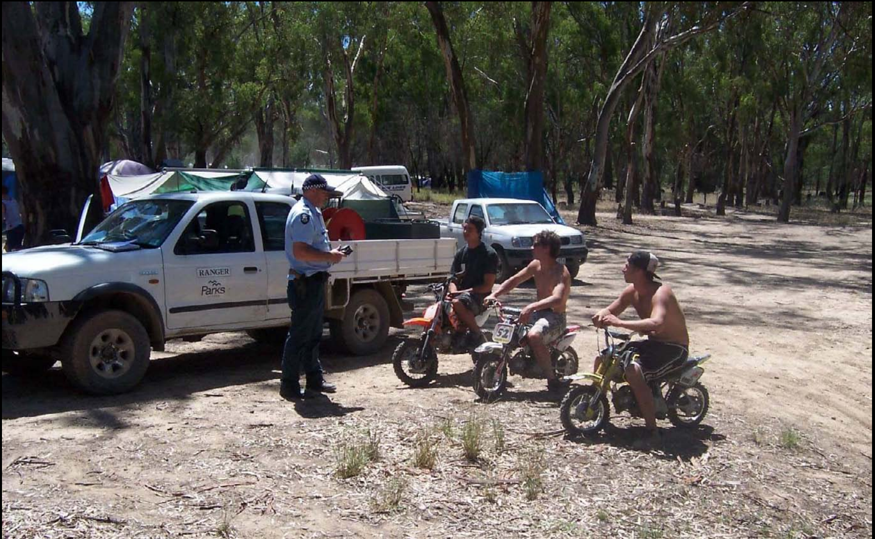
Enforcing motorbike regulations