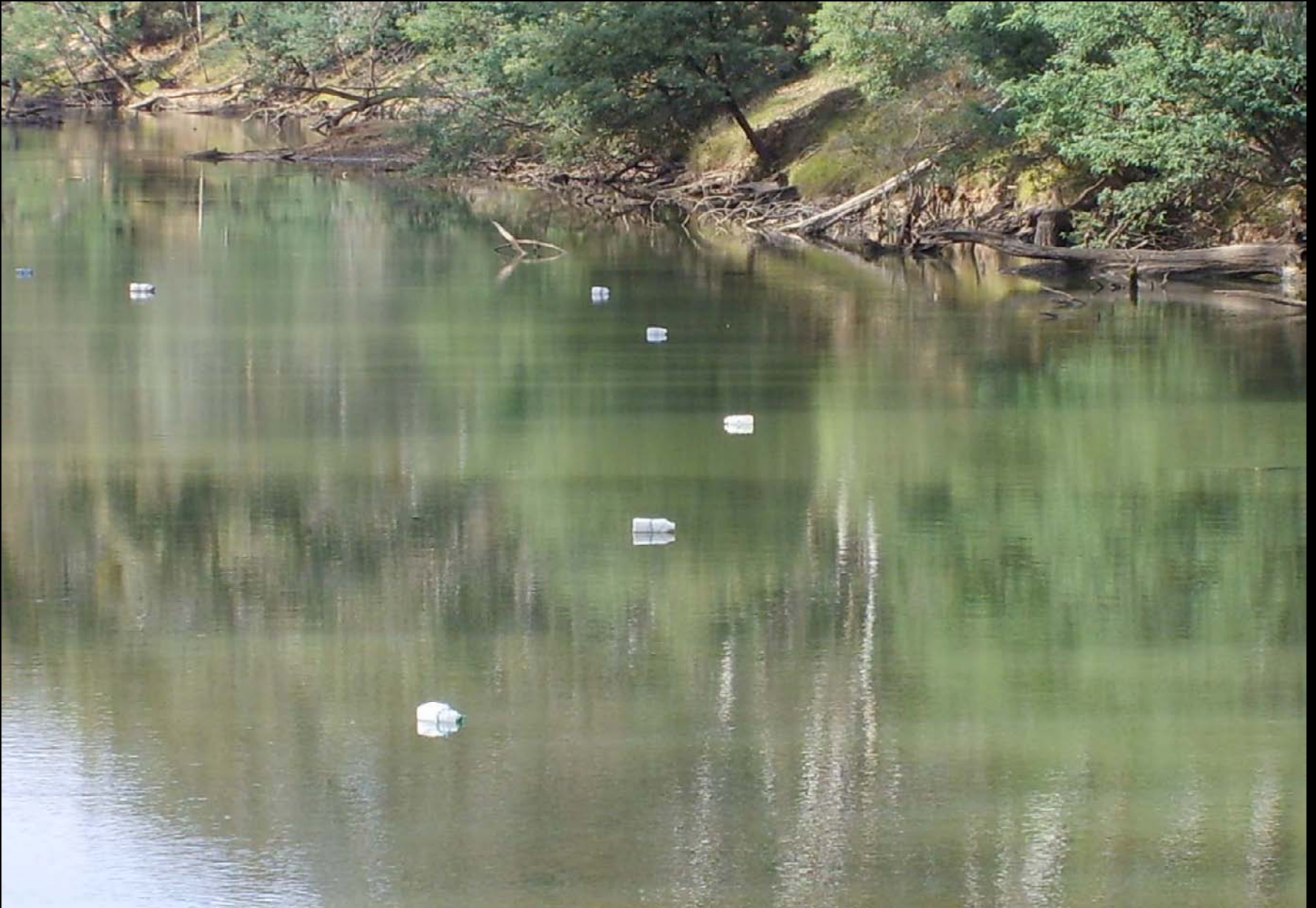
Enforcing fishing regulations