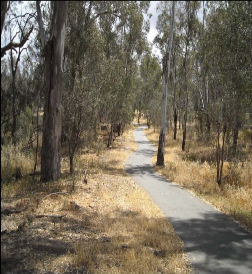
Goulburn river shared path