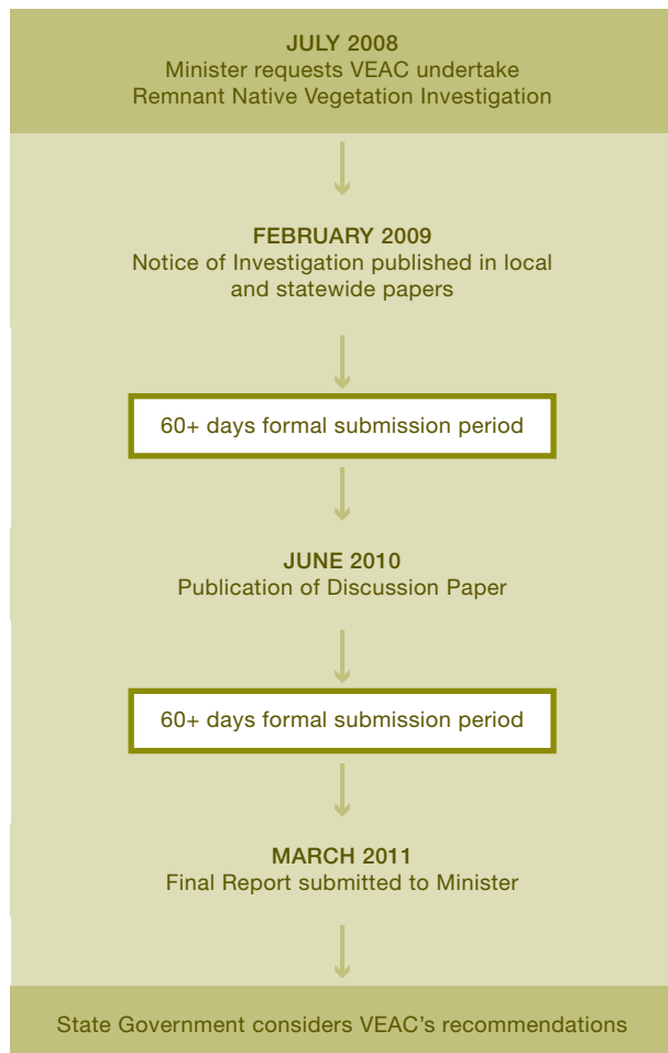
Figure 1.2 Investigation process and timeline.

This final report completes the investigation and was submitted to the Minister for Environment and Climate Change, the Hon Ryan Smith MP on 31 March 2011.