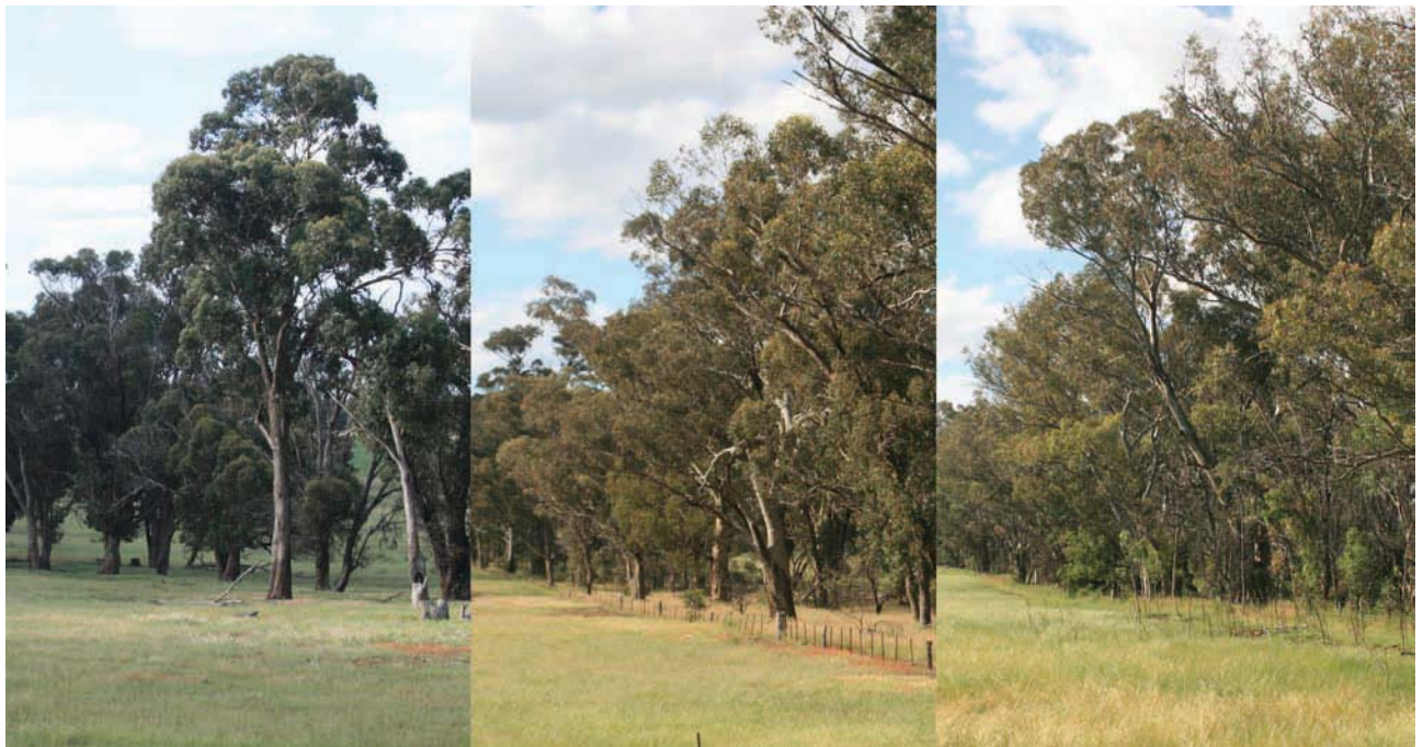
An example of unused roads illustrating the differences in understorey structure of (from left to right) unfenced, fenced with access track, and fenced to exclude use.

Very many unused road reserves have been historically used for agriculture and as a consequence about half of the total area of native vegetation is estimated to have been fully cleared of native vegetation, with a substantial remaining proportion in a degraded condition. Despite this, in some areas unused roads frequently contain biodiversity representative of local landscapes. The quality and extent of remnant biodiversity within unused road reserves varies depending on use. Unused road reserves grazed by stock tend to have no understorey, recruitment of trees is minimal and soils are damaged through compaction. Not all road reserves are heavily exploited by land holders. Unused road reserves may be fenced and strategically grazed to control weeds or excluded from grazing entirely.