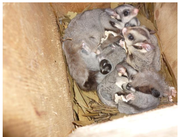
Photo: Sugar gliders in nest box.

For more information on nest boxes, visit www.latrobe.edu.au/wildlife/nursery/nestboxes