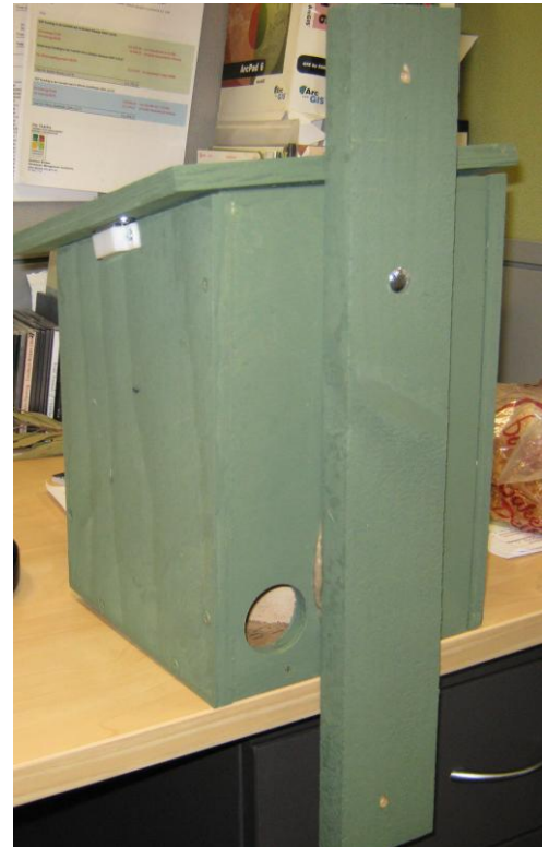
Exterior view of a nest box

Baffle to inhibit birds using the nest box