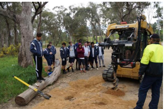
Image 2: Shepparton High VCAL students with Parks Vic crew at Shepparton Weir