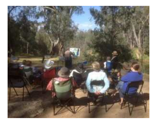
Image 2 Left: Canoeists paddle downstream under the Watt Rd Bridge. Image 3 Right: Art Classes along the River at the Goulburn River, Tom Collins Drive

Spotlight Walks –Community walks lead by Goulburn Murray Landcare Network spotting various local nocturnal species along Goulburn River locations.