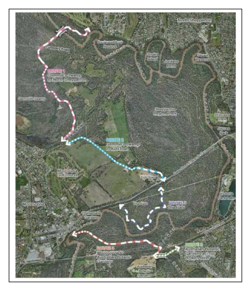
Image 2: Five proposed new routes outlined in the RiverConnect Paths Master Plan.