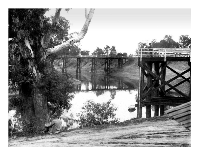
Image 10: Goulburn River showing Fryers Street Bridge and Jetty - circa 1900

RiverConnect staff would like to thank all community and agency members who participated, assisted or provided guidance on any RiverConnect event, activity, meeting or Management Plan.