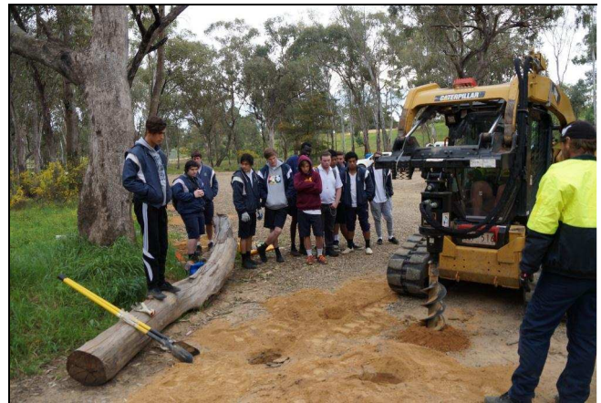
Image 5. Shepparton High VCAL students with Parks Vic crew at Shepparton Weir in September