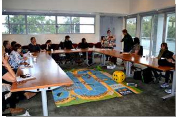
Image 7: Teachers sharing ideas at the Professional Development Training