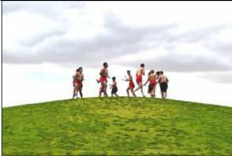
Image 6: Traditional Dance students from Shepparton High and Mooroopna SC on the grassy knoll at Victoria Park Lake.