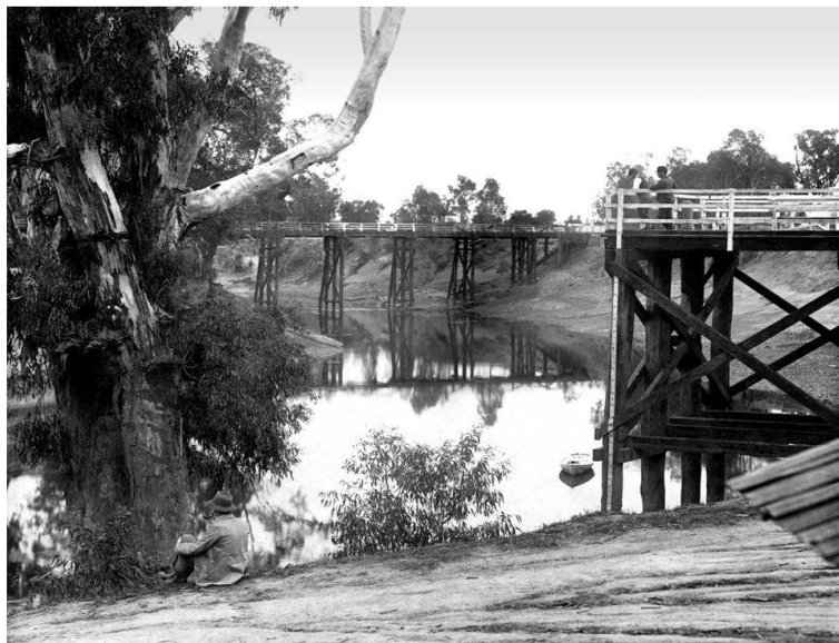
Image 10: Goulburn River showing Fryers Street Bridge and Jetty – circa 1900

RiverConnect staff would like to thank all community and agency members who participated, assisted or provided guidance on any RiverConnect event, activity, meeting or Management Plan.