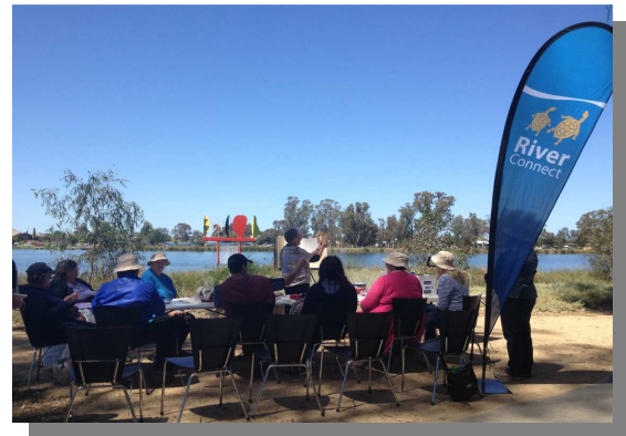
Image 2 Left: Canoeists paddle downstream under the Watt Rd Bridge. Image 3 Right: Art Classes along the River at Victoria Park Lake in October 2013