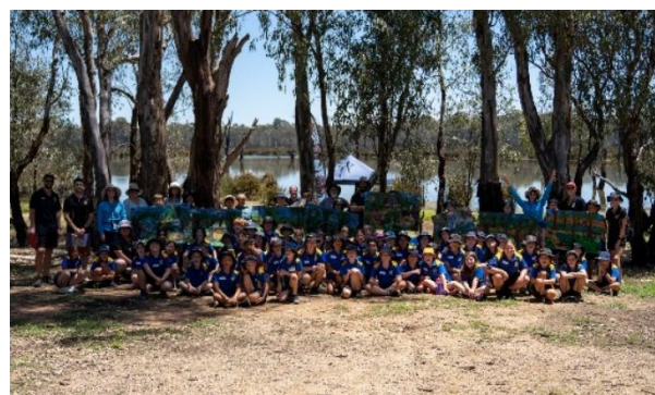
Figure 9. A jam-packed activity rotation environmental education day out at Reedy Swamp for Bouchier Street Primary School Grade 3s & 4s.