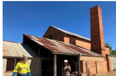
Figure 11. Something new every day for work experience student Alexine including a tour of historical site, Days Mill by Parks Victoria in the lead up to their popular public event.