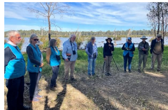
Figure 8. Highlighting the power of volunteers to the Australian Public Service Senior Executive Service Band 2 Leadership Program participants.