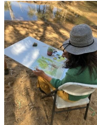
Figure 26. Dipping inspiration from the Broken River at 'River's Palette: a watercolour workshop in nature'.