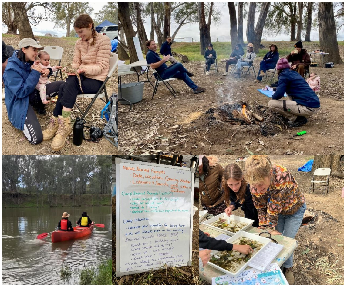
Figure 2-6. RiverConnect Caring for Nature Youth Camp participants soaking up local knowledge, stepping outside of comfort zones and connecting with themselves and nature in new ways.