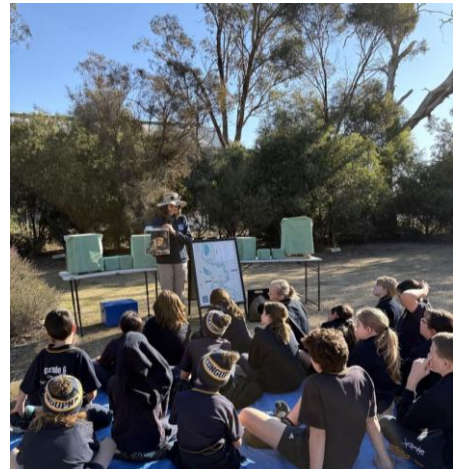
Figure 12 (above). Guided "A Hollow is a Home" session by RiverConnect Education Officer for Congupna Primary School.