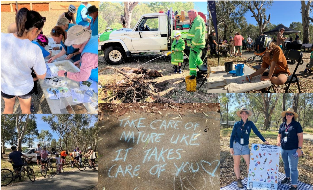
Figure 15 (top left). Shepparton Mooroopna Urban Landcare (SMULG) volunteers 'Bugging out by the water'.