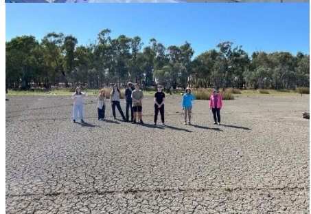
Figure 14 (above). ACE College checking out Reedy Swamp in its drying phase after setting up some photopoint monitoring for future revegetation comparisons.