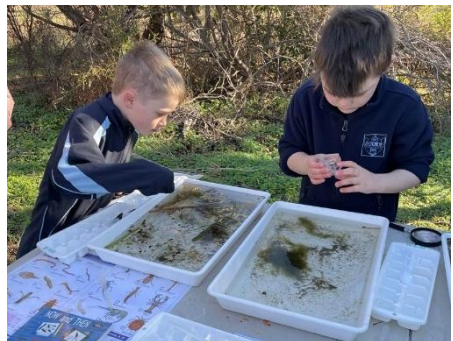
Figure 13 (below). Water quality investigations "Waterbugs and Waterways" with Dookie Primary School.