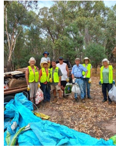
Figure 21 (above). Rubbish bags in hand, the Friends of Gemmill Swamp take part in Clean Up Australia Day.