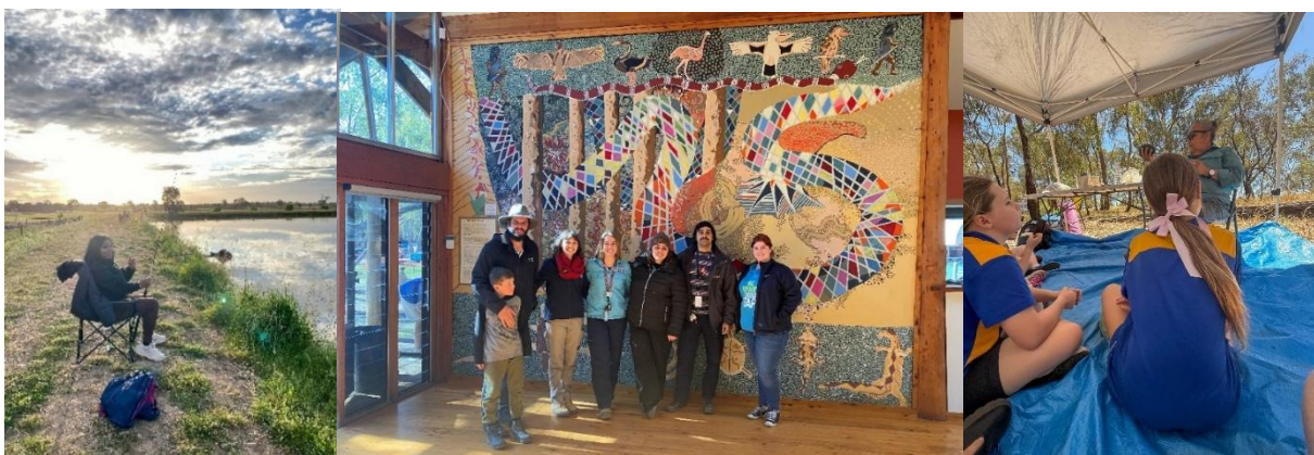
Figure 27 (left). A RiverConnect Caring for Nature Youth Camp participant waiting for a bite at the Arcadia Fish Hatchery.