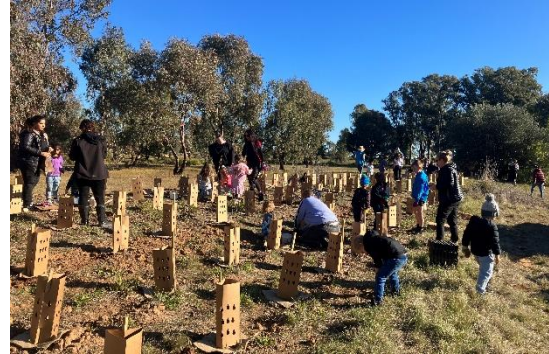
Figure 7. The Mooroopna community out in full strength at their local community planting day.