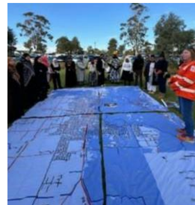
Figure 22 (below). Working through language barriers to communicate flooding at the Multicultural Preparedness Session.