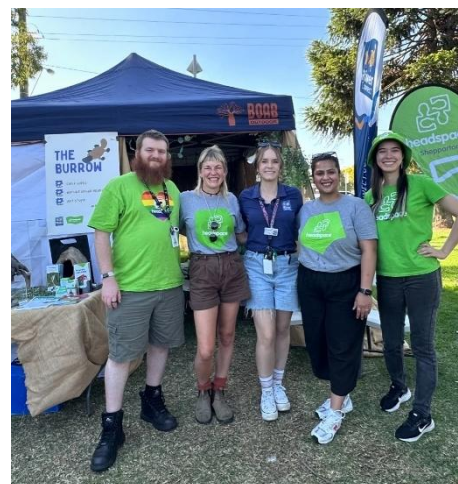
Figure 23. "The Burrow" youth chill space returns at Converge on the Goulburn.