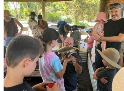
Figure 10. Inspiring a lifetime of turtle conservation with up close experiences at Turtle Talk in Tatura.