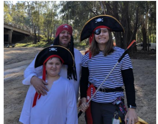
Figure 3. The "Pollution Pirates" cleaning up the Goulburn River.