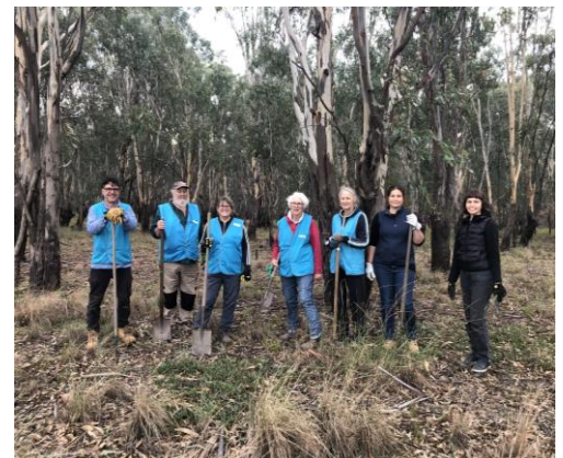
Figure 4. Shepparton Mooroopna Urban Landcare Group members ready on the tools for their weekly "Weeding the Bush" activity.