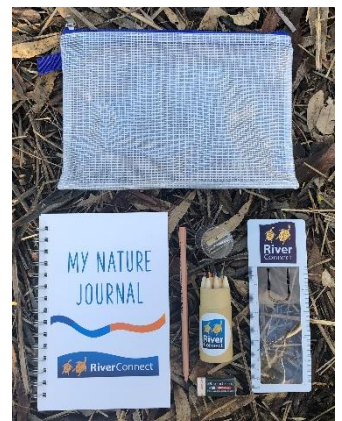
Figure 9. Nature Journal Kit prize.