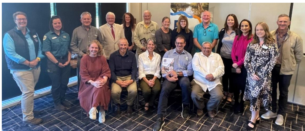
Figure 1. The RiverConnect Implementation Advisory Committee representatives celebrating the RiverConnect Strategic Plan Launch on 30 March 2023.