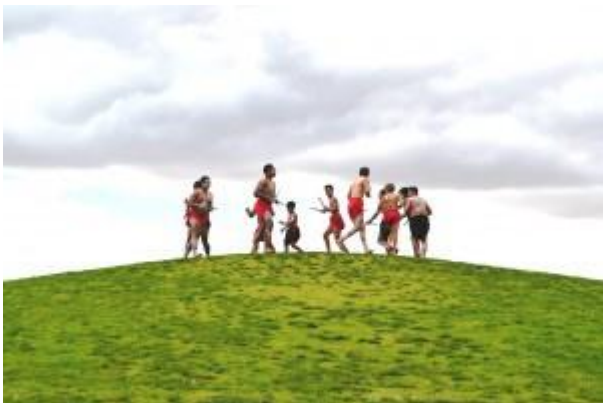
Image 3: Traditional Dance students from Shepparton High and Mooroopna SC on the grassy knoll at Victoria Park Lake.