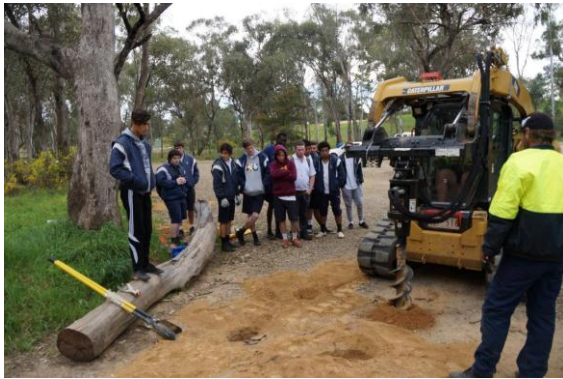
Image 2: Shepparton High VCAL students with Parks Vic crew at Shepparton Weir