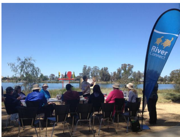
Image 1: Art Classes along the River at Victoria Park Lake in October